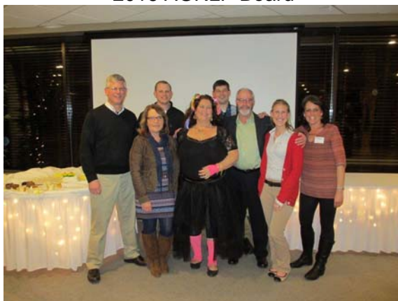
2016 AGRLP Board