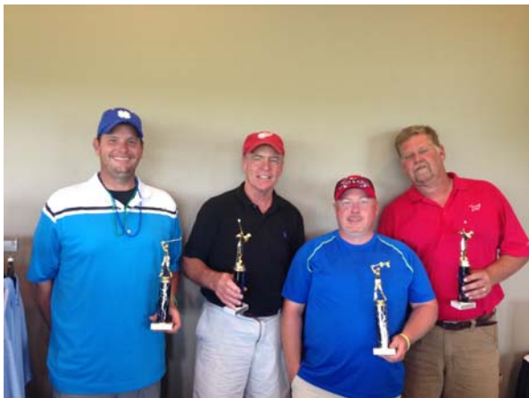
OUR 2016 WINNING TEAM FROM ECO GREEN SUPPLY